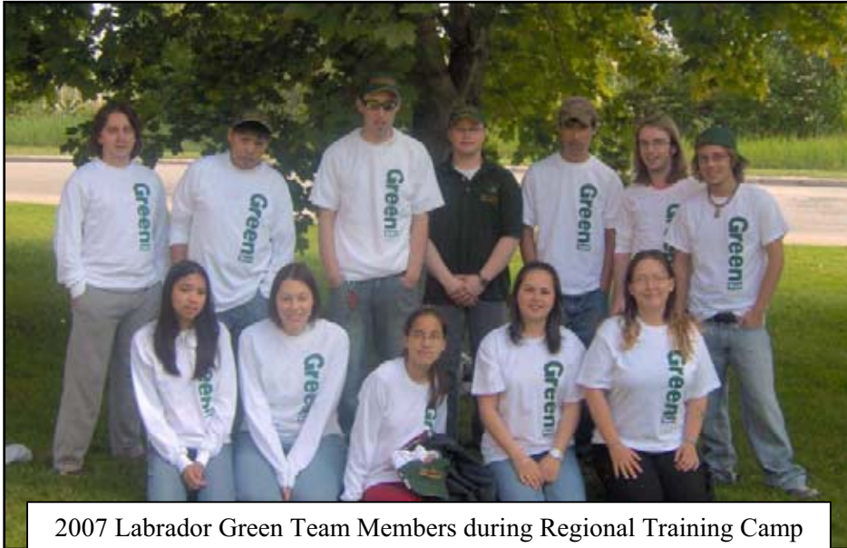
2007 Labrador Green Team Members during Regional Training Camp